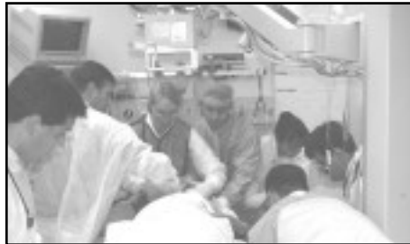
The Trauma Team in action

Nurses are allocated to their specific roles at the beginning of each shift and nurses roles are interchangeable from shift to shift. Additional nurses are often required for multiple trauma. The nurses response to trauma team activations are excellent. A recent review of the nursing performance as part of the trauma team at Liverpool found all three nursing members are present on arrival of the patients in 94% during day shift and 80% after hours (2). Pre arrival preparation is vital.